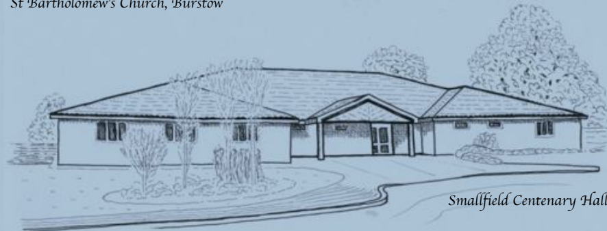
Smallfield Centenary Hall