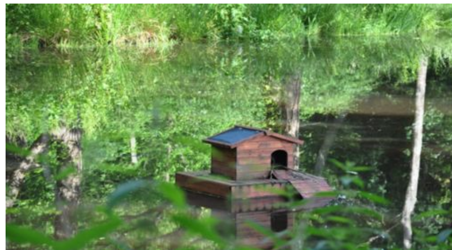
June - either they tried again but not very tidy homekeepers!