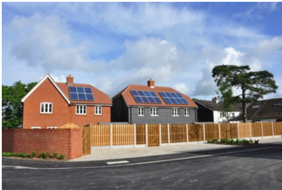
Rear view of two 2 bed houses and two 3 bed houses

We haven't been quite so successful with the Duck House! As you can see opposite a duck has been near the 'castle' and I did see the lady sitting inside, but moorhens seem to have been sighted many more times than ducks – we will have to keep watch!