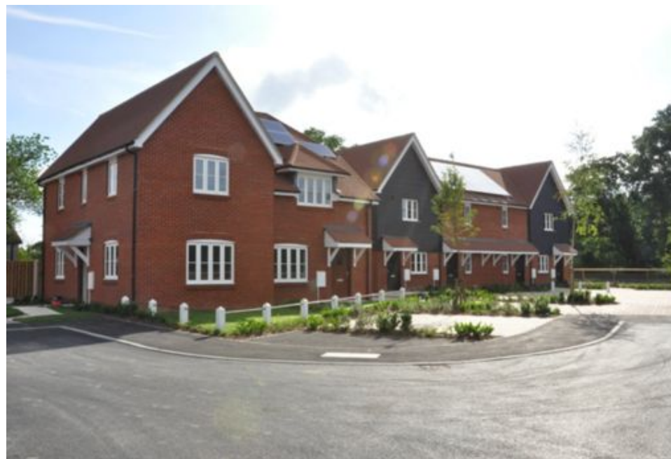
Four flats and two 2 bed houses

The keys have been handed over to the new tenants at Burstow Gardens and they should all be in residence by now! The houses/flats are really super, each unit having its own garden, shed, water butt and rotary clothesline! The communal beds have been planted and the grass, with all the rain, is growing apace! The standard of the facilities and the space inside is really generous. Members of the Council were invited to have a look around the site and were duly impressed. It is fantastic to see the completion of this long project at last. We will be having an opening ceremony but only after everything has settled down! We welcome the new residents to these lovely homes and hope they have a happy future in them, and enjoy being near to their families as well!