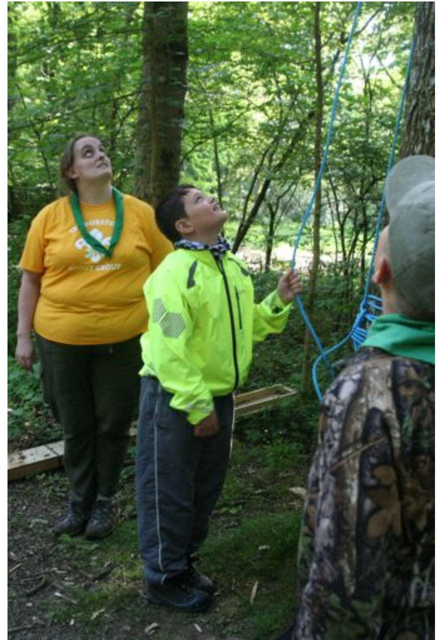
Photos: Promise and Flag Break 19