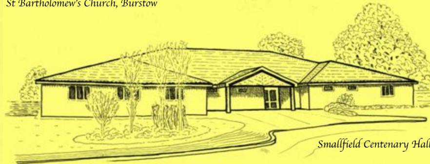
Smallfield Centenary Hall