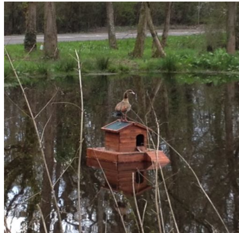
May - They have a look but not good enough!

The one success for volunteers has been the Neighbourhood Watch. Another meeting has been held and the network is spreading – many thanks to all of those who have come forward.