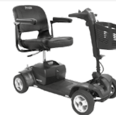
ELITE TRAVELLER SPORT - £1,199 (ex vat)