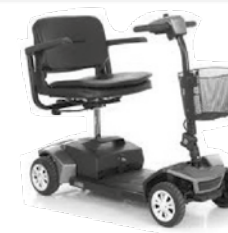
TRAVELUX TIEMPO - £795 (ex vat)