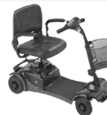
ULTRALITE 480 - £699 (ex vat)

Atlas Mobility offers a full range of lightweight scooters you can use to get to the shops or get out and about with family and friends. The new light weight design means you can easily take your scooter on holiday via plane, train, coach or boot of the car.