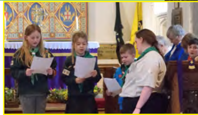
After spending the night at the Scout HQ, members of the troop walked to St Bartholomew's, Burstow for the Mothering Sunday service, where the Beavers and Cubs took part with the readings and prayers and carried the colours.