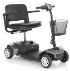
TRAVELUX TIEMPO - £795 (ex vat)