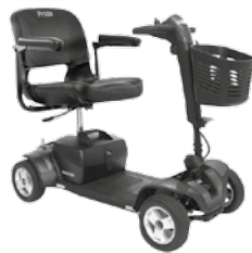
ELITE TRAVELLER SPORT - £1,199 (ex vat)