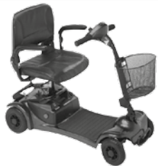
ULTRALITE 480 - £699 (ex vat)

Atlas Mobility offers a full range of lightweight scooters you can use to get to the shops or get out and about with family and friends. The new light weight design means you can easily take your scooter on holiday via plane, train, coach or boot of the car.